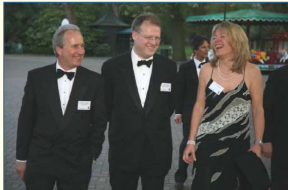
The London Citywealth Top 100 Event 2006

Who will win the inaugural U.S. Magic Circle Awards?