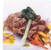
World Class Cuisine